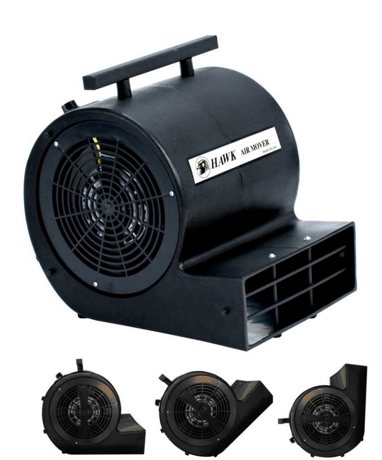
Moves Air at 3 Angles